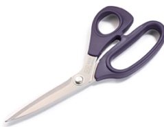
Dressmakers Shears – 10" / 25cm