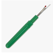
Seam Ripper or Snips