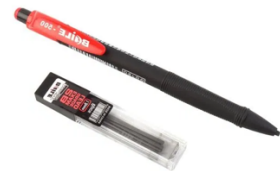
Mechanical Pencil plus 2H or HB Leads or Regular HB / 2H Pencil plus Sharpener