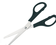
General Purpose Scissors for Paper