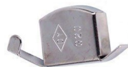
Magnetic Seam Guide for Sewing