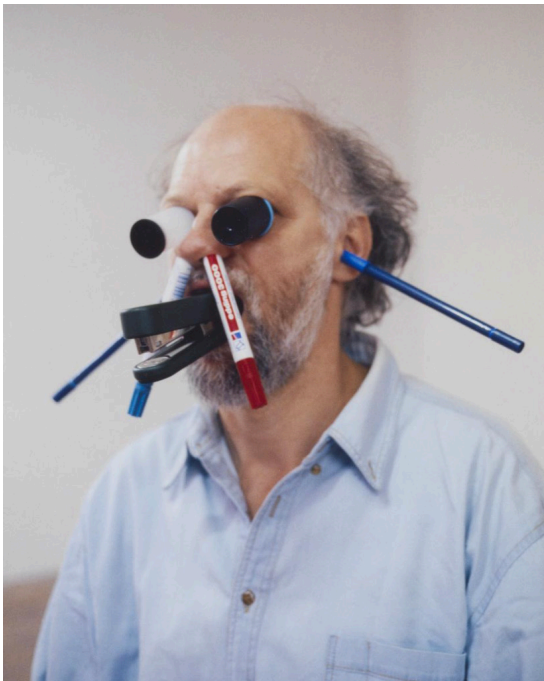
Ervin Wurm 1997.