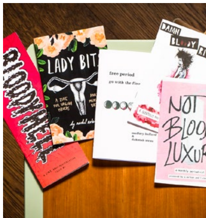
Welcome Collection Zine Library