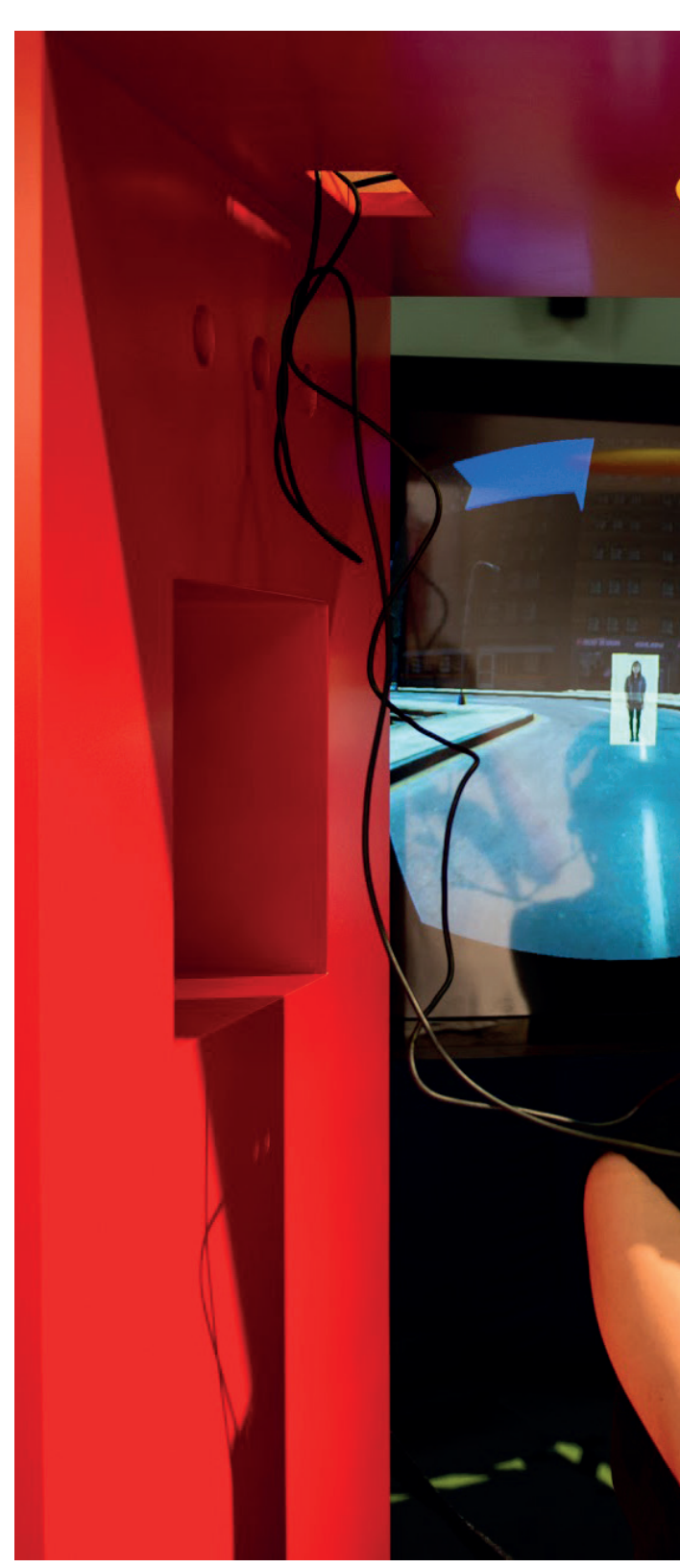
Virtual Reality student project

ravensbourne.ac.uk/outreach @RavensbourneWP #OurRavensbourne outreach@rave.ac.uk