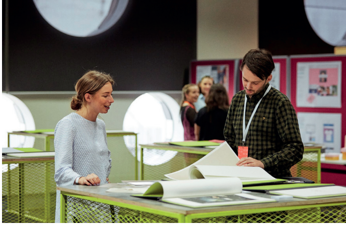
Fashion lookbooks at the Degree Show 2017